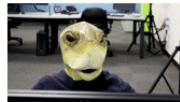
Tranquil Turtle People Focussed Introvert