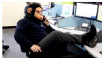
Much-Loved Monkey People Focussed Extrovert